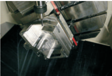
Figure 1: Simultaneous cutting of a battlefield override chassis on one of the 5-axis Mazak Machining Centers at Magnus Hi-Tech.

Magnus Hi-Tech Industries Inc., ( www.magnusht.com ) Melbourne, Florida, is good at what it does: providing high quality solutions to the full range of its customers' fabrication needs. Using advanced sheet metal fabrication and machining technology, coupled with rigorous quality methodologies, has enabled Magnus Hi-Tech to win a host of customers in the defense, aerospace, medical and other demanding fields.