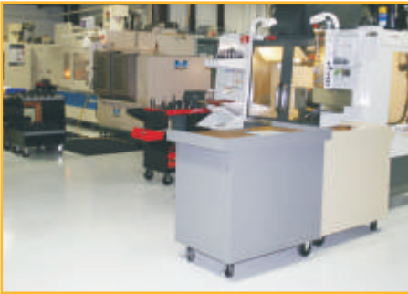
Pioneer Surgical's 36,000 sq.ft. manufacturing space includes the latest technology in machining and manufacturing equipment

Medical device manufacturer, Pioneer Surgical, has built a reputation for innovation and responsiveness with help from highly skilled people and powerful CAMWorks® software