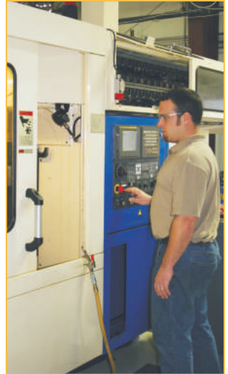
Amongst Pioneer's several machining centers, is a Tsugami FMA 3